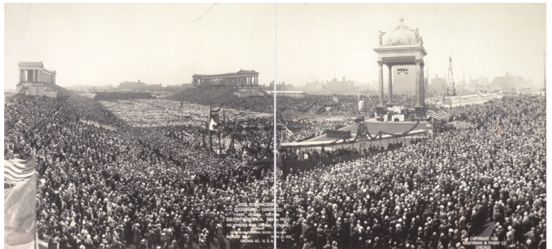
The XXVIII International Eucharistic Congress gathers at Soldier Field in Chicago, with nearly 400,000 in attendance. (June 1926)

This weekend, nearly 50,000 have gathered for the 10th National Eucharistic Congress in Indianapolis. This is the culmination of years of planning, which ultimately is targeted at inviting the entire Church to renew its devotion to the Holy Eucharist. While this event is taking place hours from here, we are all united in spirit through the Eucharist we share. Heaven and earth are joined each time we call upon the presence of our Lord at Mass. He wishes to feed us with his own flesh as we recognize him as Lord. God is not a far-away reality, but one who speaks to the hunger of our souls inviting us to eat, drink, and live!