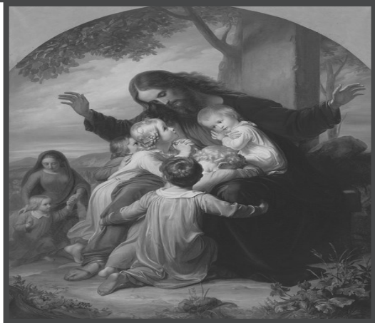
Enjoy New Artwork: Let the Children Come To Me